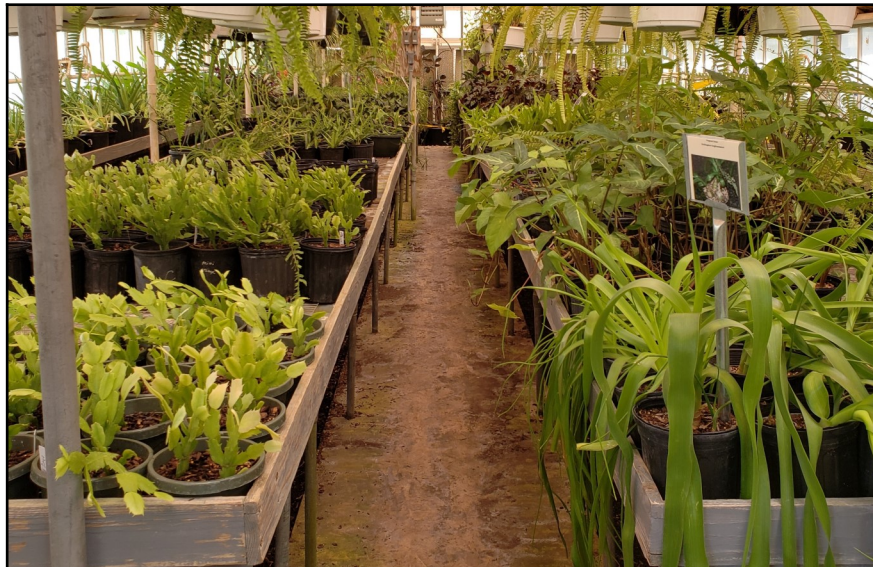
Residents learn horticulture skills while working at the NEFSH "Nature's Touch Greenhouse".

NEFSH will participate in the APPIC computer matching system for intern selection for the coming year. Applicants must register online to participate in the Match. You can register at: www.natmatch.com/psychint . Notification of your final status relative to this internship will be through the APPIC Matching Service. This internship site agrees to abide by the APPIC Policy that no person at this training facility will solicit, accept, or use any ranking-related information from any intern applicant prior to Match Day.