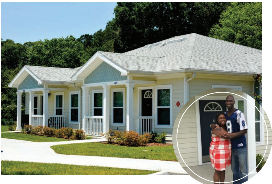
Village on Wiley 43 units, funded by Florida Housing Finance Corporation

The Solution That Saves program provided Permanent Supportive Housing to members of the homeless community. The evaluation focused on 68 participants who remained enrolled in the study for a minimum of two years. The evaluation findings compared two time periods: the two years before (pre) moving into housing, and the first two years after (post) moving into housing.