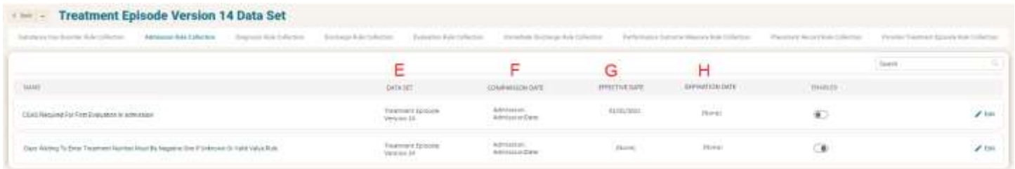
Mockup 2 (above): Proposed functionality for Rule Collection Window