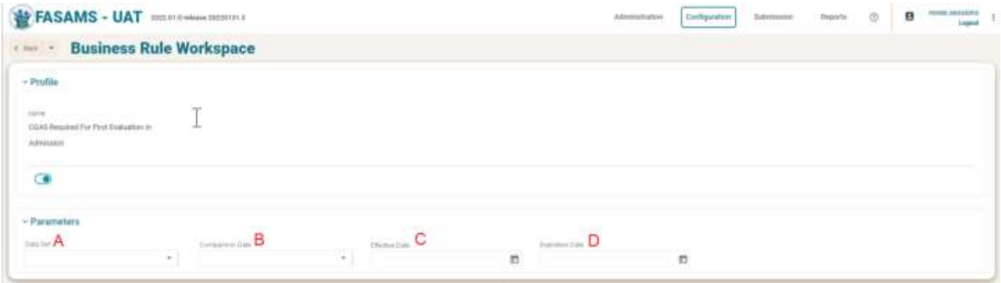
Mockup 1 (above): Proposed functionality for Business Rule Workspace