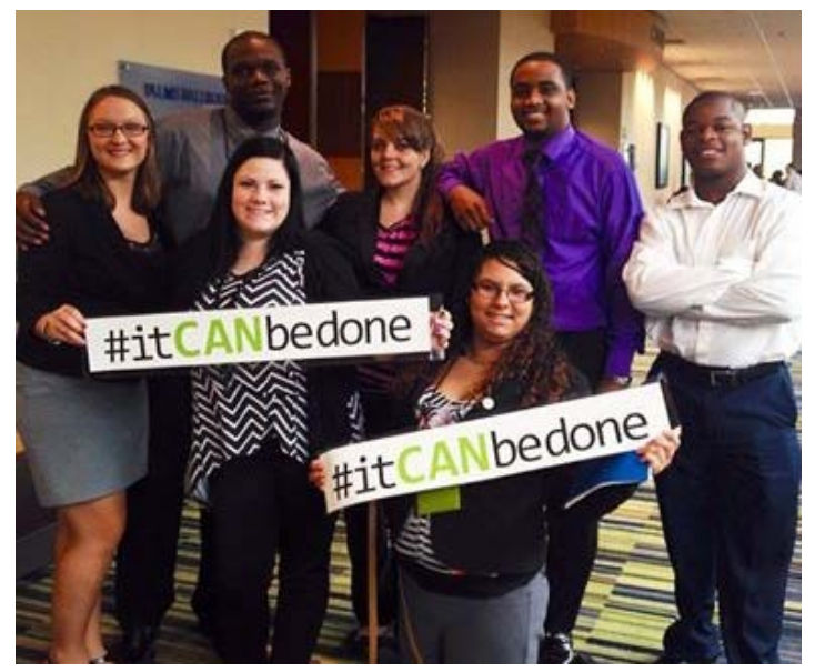
Photograph of Independent Living Young Adults at the 2014 Child Protection Summit

Youth participating in this workgroup would be requested to participate in one additional substantive workgroup, such as the group care, employment, education, or juvenile justice workgroups.