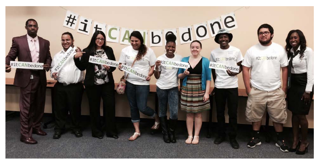
Photograph of the Suncoast Region #itCANbedone campaign launch