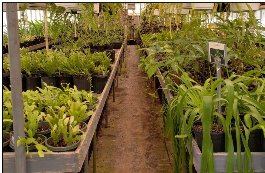
Patients learn horticulture skills while working at the NEFSH “Nature’s Touch Greenhouse”.

NEFSH will participate in the APPIC computer matching system for intern selection for the coming year. Applicants must register online to participate in the Match. You can register at: www.natmatch.com/psychint . Notification of your final status relative to this internship will be through the APPIC Matching Service. This internship site agrees to abide by the APPIC Policy that no person at this training facility will solicit, accept, or use any ranking-related information from any intern applicant prior to Match Day.