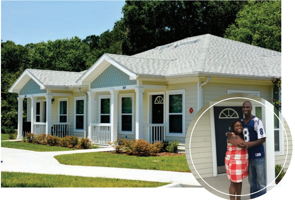
Village on Wiley 43 units, funded by Florida Housing Finance Corporation

The Solution That Saves program provided Permanent Supportive Housing to members of the homeless community. The evaluation focused on 68 participants who remained enrolled in the study for a minimum of two years. The evaluation findings compared two time periods: the two years before (pre) moving into housing, and the first two years after (post) moving into housing.