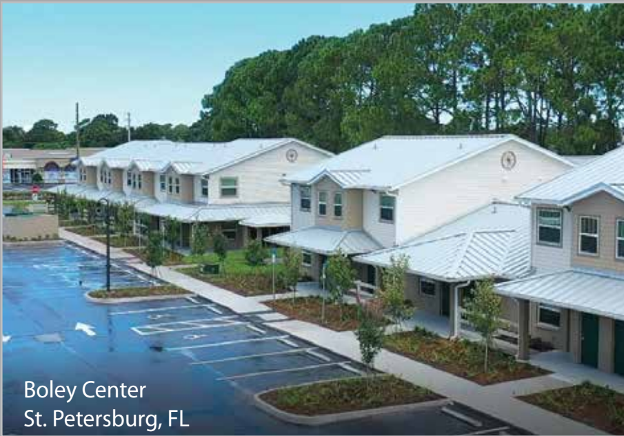
Boley Center St. Petersburg, FL

Supportive Housing is high quality housing that is operated for the benefit of its residents and the community