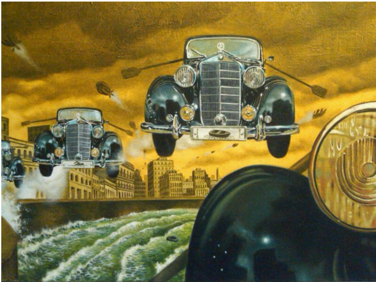
Photo of painting by Cuban Refugee Enrique Rafael Ermus Forgas the Artist